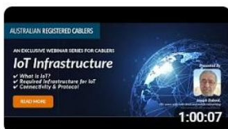
IoT Infrastructure 66 views • 3 months ago

Australian Registered Cablers You Tube Video Presentations, click on the images below