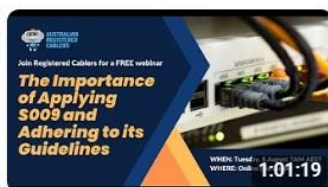
The Importance of Applying S009 and Adhering to its... 591 views • 1 year ago