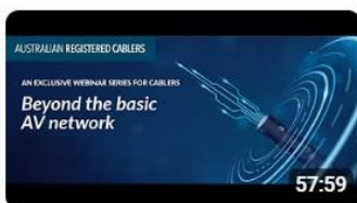
Beyond the Basic AV Network 198 views • 8 months ago