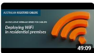
Deploying WiFi in residential premises 881 views • 1 year ago